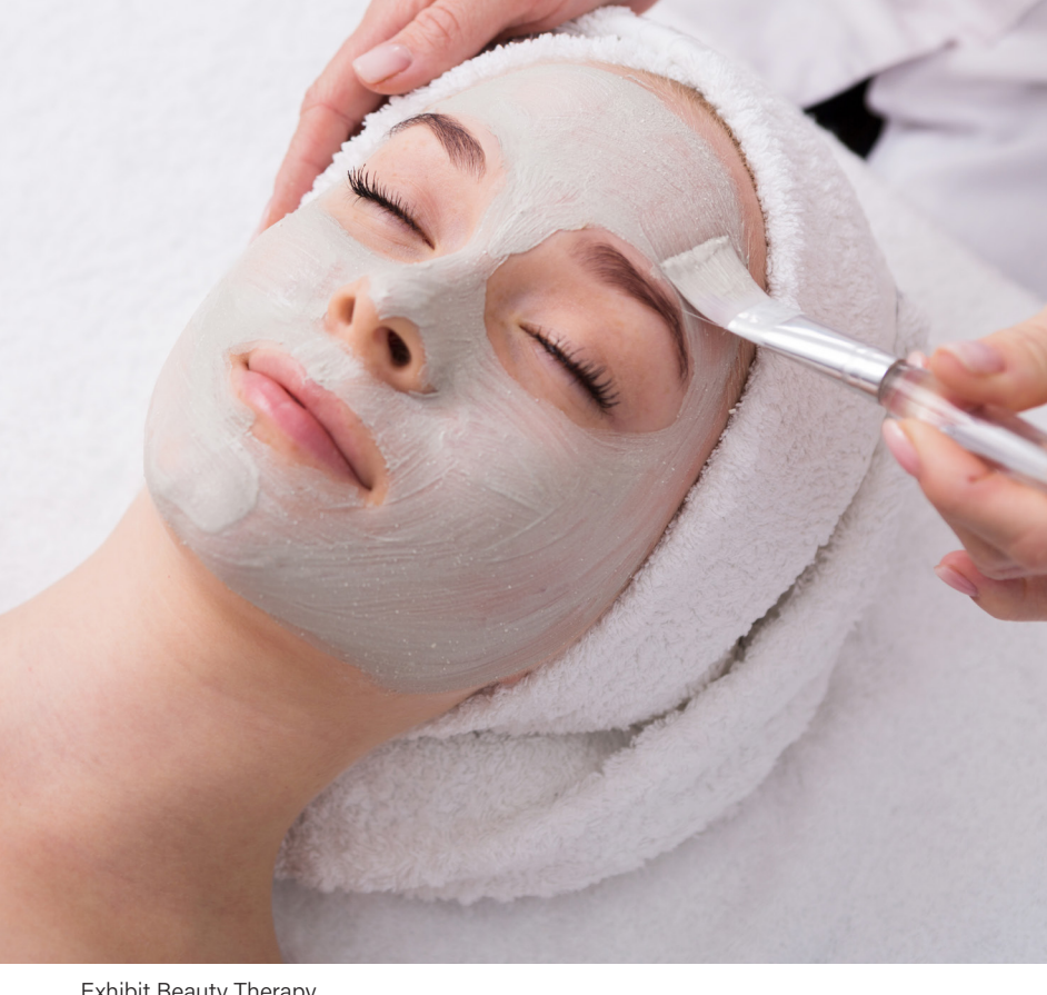
Exhibit Beauty Therapy